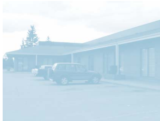
The Markham Federation of Filipino Canadians Community Centre